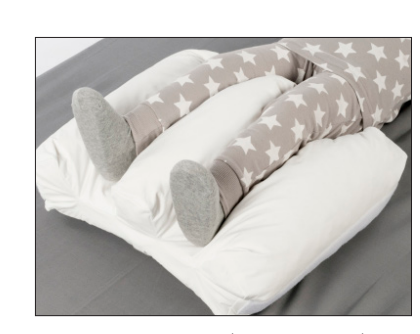
W leg trough (size 1 - 5) Pictured using without the wrap Positions the user's legs Prevents rotation and risk of dislocation