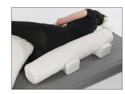
Roll (size 1 & 2) Use as a head, knees or back support Curved wedge (3 sizes) Supports the body or other components