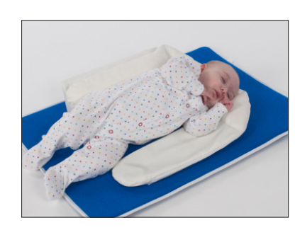
Segmented horseshoe Supports side lying