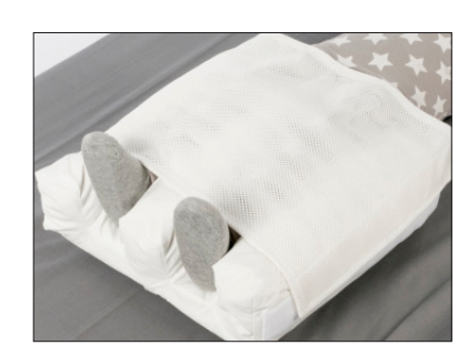
with wrap (size 1 - 5) The adjustable wrap provides extra support for the abducted legs