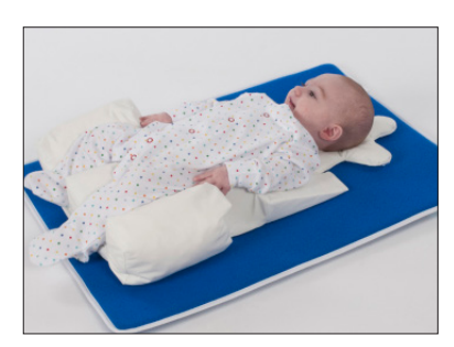
Box W Wedge & ramp (pair) Daisy