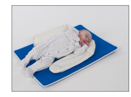
Little Dots system Segmented Horseshoe, Daisy, Box W, Fleece Overlay, 3 sizes of Wedges (pairs) and Wedge & ramp (pair)