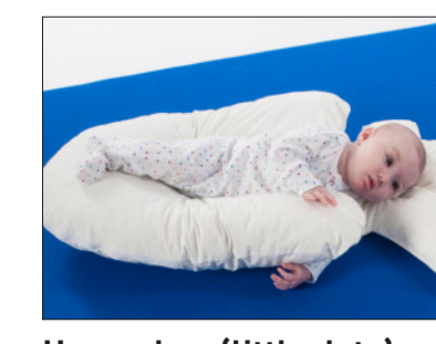
Horseshoe (little dots) Use between the legs in side lying Use as a full supine support