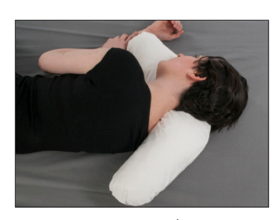
Banana cushion (size 1 & 2) Head support in side lying Supports feet or other parts of the