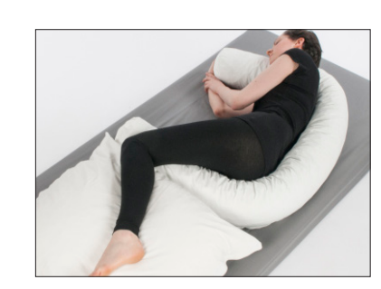
Body roll (size 1, 2 & 3) Supports head, trunk and legs Pillow size (1 & 2) See product opposite