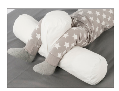
T-roll (size 1 & 2) Inhibits adduction Supports the user's legs in abduction