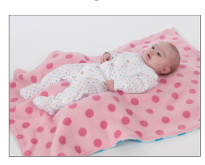
Fleece overlay Image presents fleece overlaying Box W, Wedge & ramp (pair) & Daisy