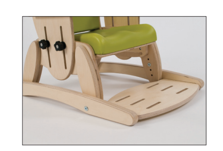
Ski & footboard<sup>1</sup> CODE SK111 - SK114 Provides foot support and offers greater stability