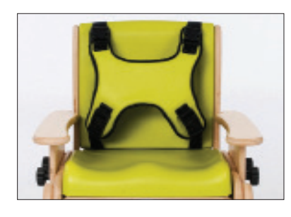
4-point harness<sup>3</sup> Provides trunk support Available in 3 colours & 4 sizes