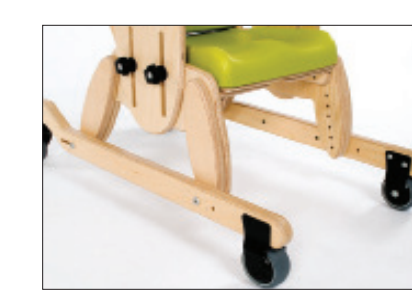
Mobile skis CODE DL101 - DL104 Gives clearance to facilitate standing transfer

2 Sliding footrest can only be used in conjunction with the mobile skis