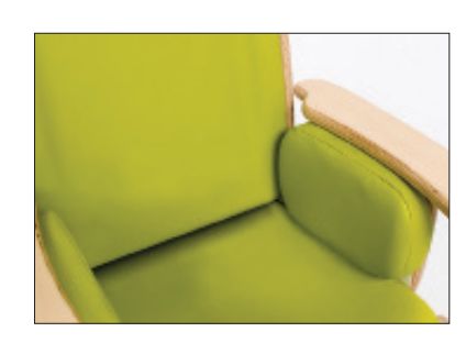
Side support cushions<sup>3</sup> Provides hip and thigh support Available in 25mm and 50mm