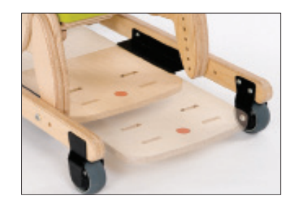
Sliding footrest<sup>2</sup> CODE DL111 - DL114 Provides foot support Slides backwards to give clearance to facilitate standing transfer