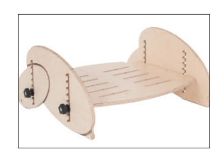
Footrest CODE FR051 - FR054 Available in 4 sizes

1 Raisers are also available in either 12mm (CODE: RA049 – RA052) or 24mm (CODE: RA045 – RA048)