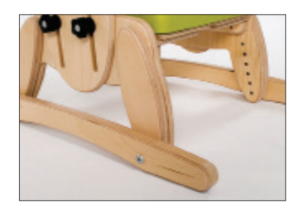
Skis CODE SK101 - SK104 Helps to stabilise and prevent chair movements