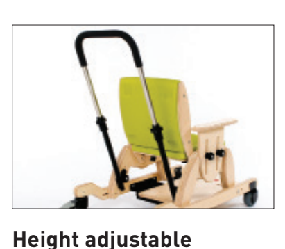
push handle CODE PH101 - PH104 Adjusts to achieve optimum push position